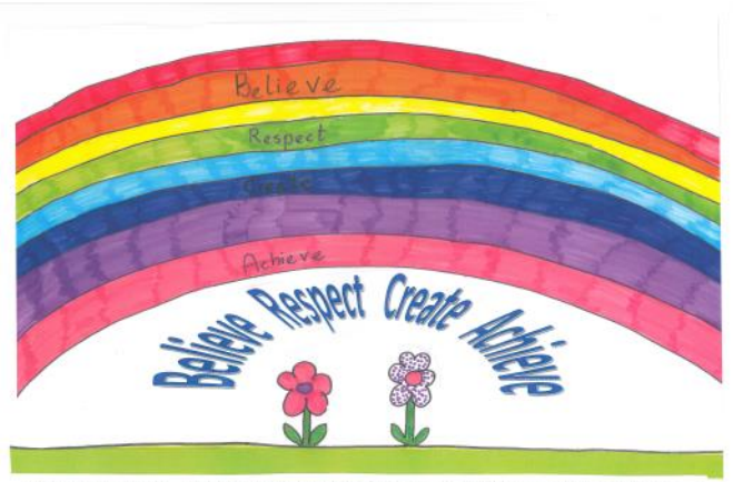
Le Creideas, urram agus le bhith cruthachail thig adhartas

Please visit our website, facebook page and twitter account to see pictures of our summer activities!